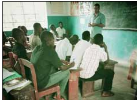
Pastors gather for training

ple groups throughout the land, they sacrifice their health, financial gain, and personal safety to spread the light of Christ to regions cloaked in darkness.