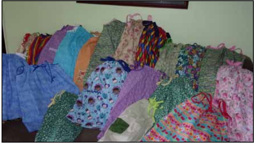
Sun Dresses destined for Sierra Leone through Eduations

LEPC website and Facebook: www.seekinggodtogether.com www.facebook.com/UPCLeicester