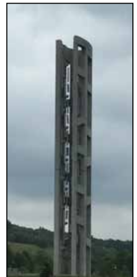
The Tower of Voices - 40 chimes for 40 heroes.