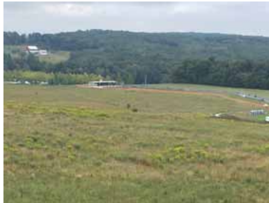
The field where they lie.