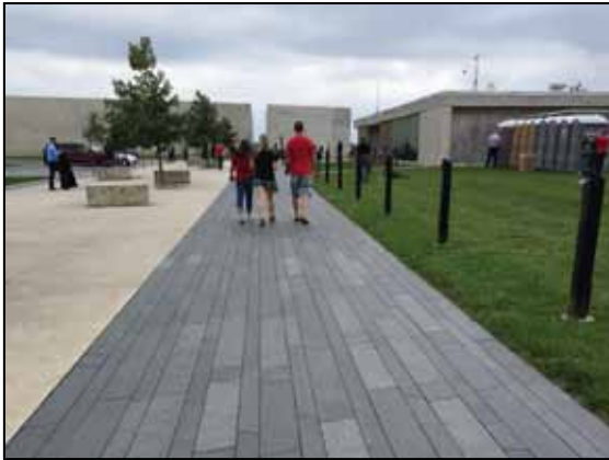
The flight path of the doomed airliners.