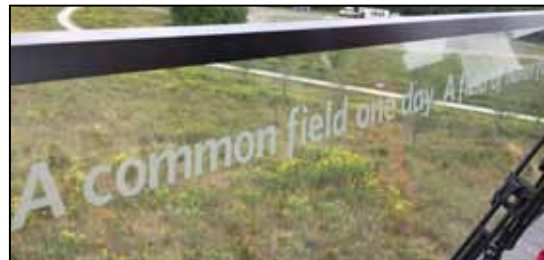
"A common field one day. A field of honor forever."