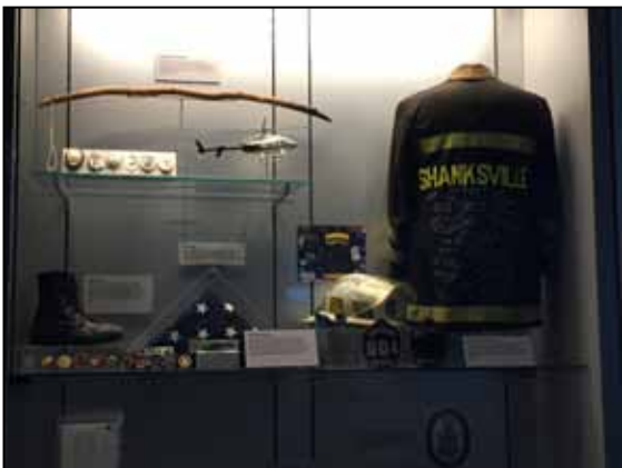
Shanksville Fire Department memorial.