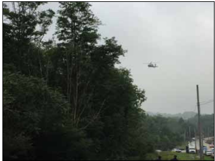
Marine One brings the President and First Lady.