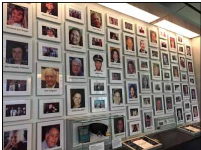
The faces of those lost.