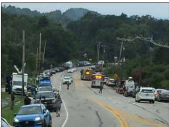
Fire Department receives a rousing welcome with cheers and honking of horns.