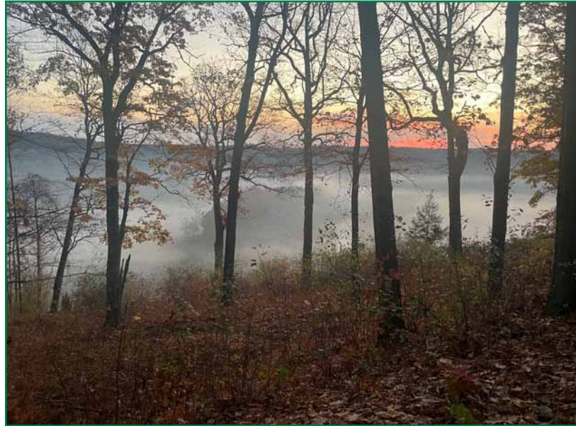
Sunrise in Letchworth Park

Each robe or shawl given is prayed over specifically for the recipient.