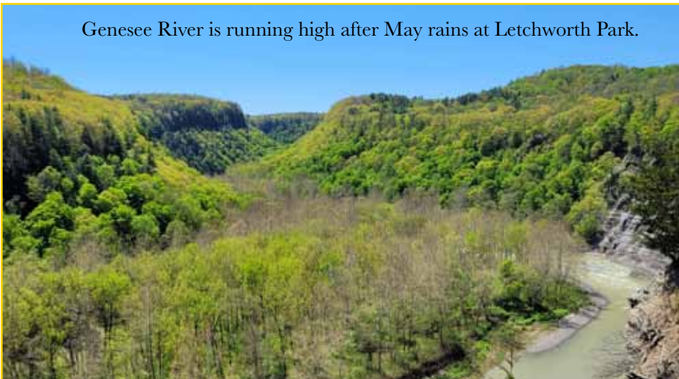
Genesee River is running high after May rains at Letchworth Park.

Leicester EPC 161 Main Street P.O. Box 202 Leicester, NY 14481